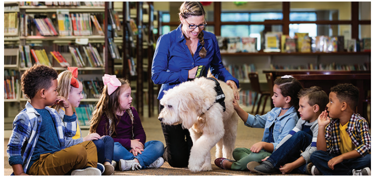
Humane Education can take place in many settings.

The most effective method for fostering humane education is for teachers to incorporate it as much as possible into their class curricula, since children spend many hours each day at school and the teacher is a role model and authority figure. There are many